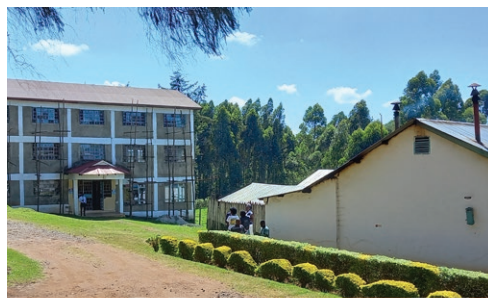
Campus at St Paul's Theological College