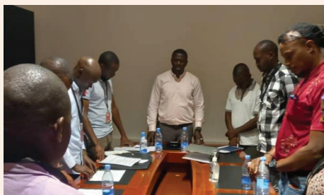
Christians from different African countries gathering in the Green Zone to pray.

APF has been a key partner in the hospital outreach ministry through their financial support and our prayer is that this continues and grows. There really is much more to be done. We look forward to having a place of safety where members can come together to worship, pray, and share the gospel with the Somali people and help them grow in faith.