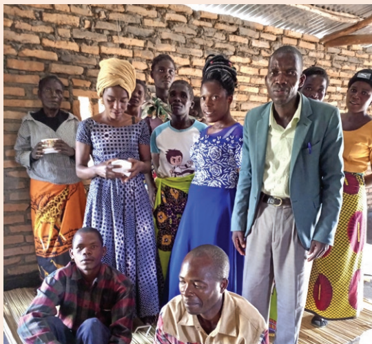
Village discipleship workshop participants

eVitabu is simple to use and very handy. Once, a pastor from the UK bought me a laptop but it was not safe to carry it on the bicycle I use to cycle very long distances. I ended up breaking it, soaked in the rain. With eVitabu, I have many powerful resources just there on my phone, but it is easy to carry and protect.