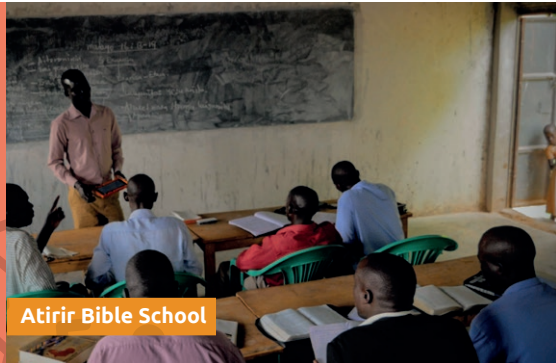
Atirir Bible School