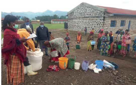
Food distribution by EEBVR church members

The Bible says, "Do not be afraid, for I am with you. Do not be discouraged, for I am your God. I will strengthen you and help you. I will hold you up with my victorious right hand" (Isaiah 41:10). This verse reminds us that God remains faithful even in tough periods.